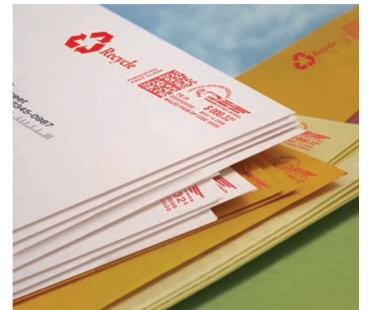
Automatic feeding, sealing and imprinting of postage onto standard envelopes and oversized pieces.

Increase your reporting capabilities and expand your accounts up to 1,500. And to maximize visibility and control, the DP825™ and DP875™ integrate with our PC-based accounting solution.