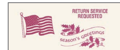
Add messages to your mail with a choice of downloadable envelope ads.

This work table provides sufficient working space to manage your mailing activity. A full range of furniture options are available.