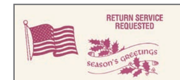
Add messages to your mail with a choice of downloadable envelope ads.

Neatly stacks mail for optimum productivity. Full sensor on stacker eliminates overflow.