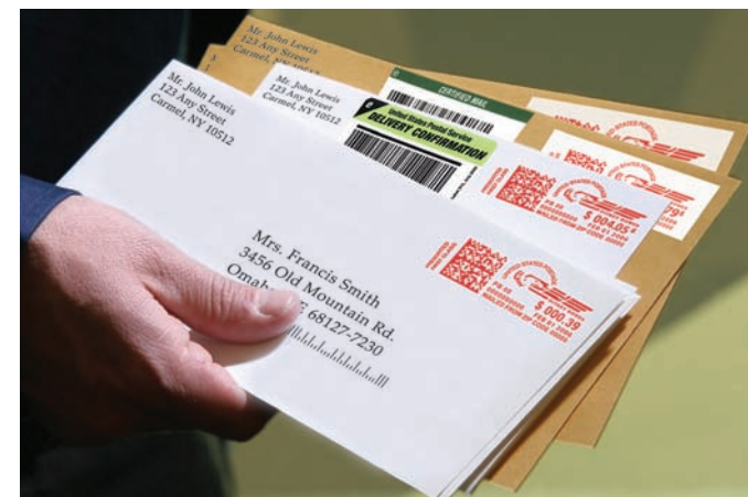
Full range of carrier rates and services right from your mail center.