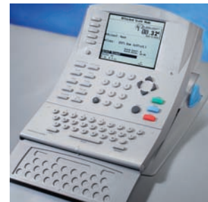
The control center offers ease of use and access to services.