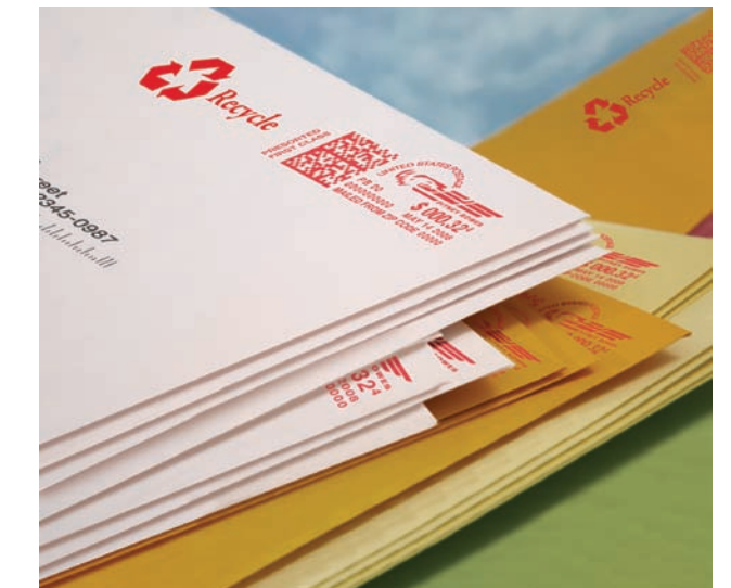
Automatic feeding, sealing and imprinting of postage onto standard envelopes and oversized pieces.

All rate selections are made through the control center and are easily updated. The weighing options include both USPS® Domestic and International rates along with optional basic carrier rates.