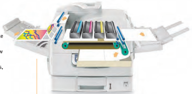
Single Pass Color™ technology and straight-through paper path handles thick paper stock and banner sheets.

The pro905DP from Oki Data Americas Inc.: high capacity and high quality—the right Digital Press for your demanding, color-sensitive short-run printing needs.