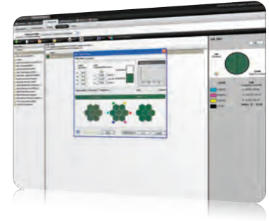
Spot-On with Substitute Colors