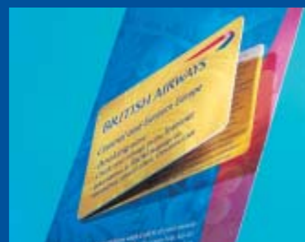
Attached plastic card