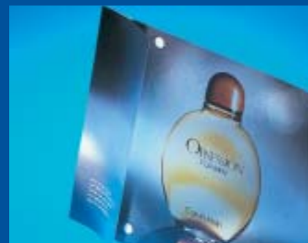
Applying of fragrance