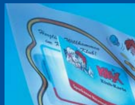
Integrated plastified card