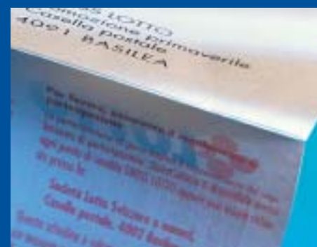
Reply card/postcard doubling