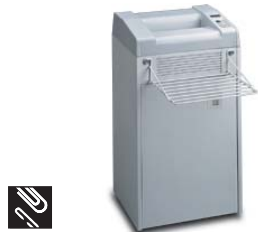
All Standard shredders will accept staples and paper clips.

A comprehensive range of models makes selecting the perfect model for your needs easy. Standard's models include Personal Shredders for desk-side convenience, Office Shredders for everyday moderate office requirements, Centralized Shredders for departmental and company needs, Industrial Shredders to meet virtually any high volume demands and High-Security Shredders for top-secret and other high security document destruction needs.