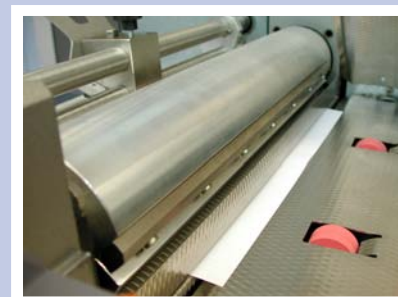
The rotary cutting system is smooth, reliable, quiet and reduce paper dust