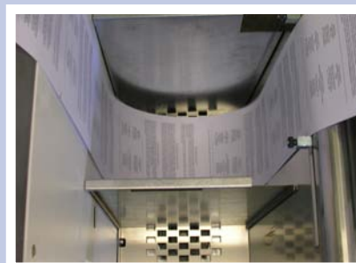
Continuous paper feed ensures smooth paper movement