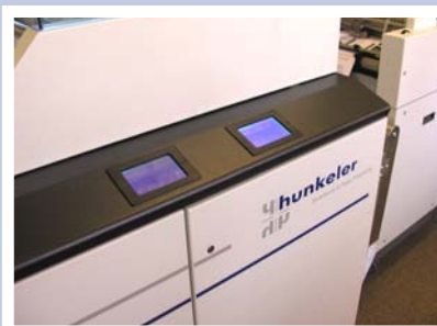
Easy operation via touch-panel