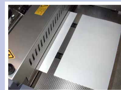
Depending on print job, sheets are cut in different length