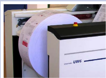
Feeding paper from a roll