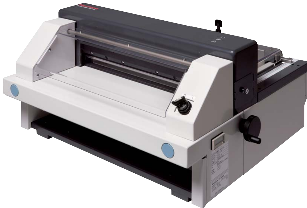
Table-top Paper Cutter for office efficiency and cost savings.