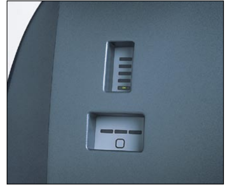
A simple operation panel features one-button control for material functions.