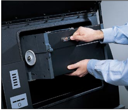
With daylight-loading material cassettes, no time is required in the darkroom.