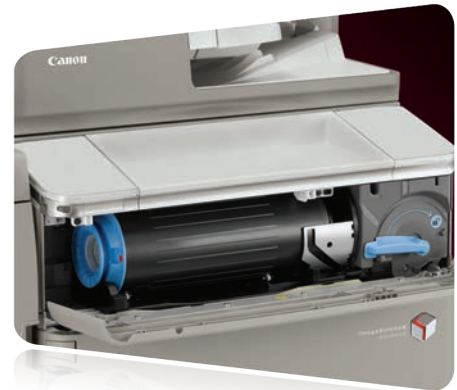
pO toner bottle

Canon's new pO (precise Output) toner faithfully reproduces detailed images and text. Across the page, solids print with an impressive evenness. Halftones and patterns retain their details, displaying smooth gradations. With our twin-sleeve technology, toner is evenly distributed across the page and throughout the print run. And in line with Canon's environmental focus, this toner helps reduce energy consumption through its ability to fuse at low temperatures.