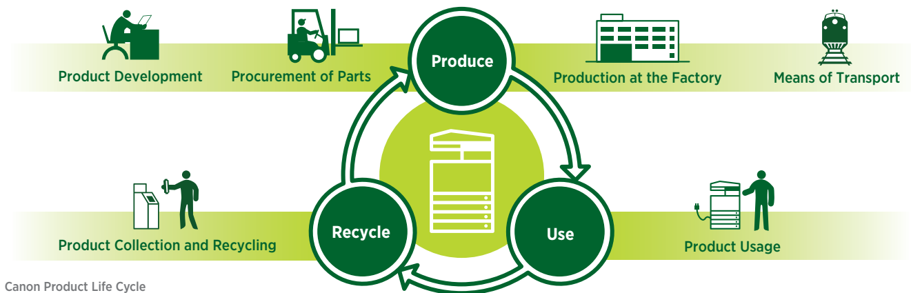
Canon Product Life Cycle

Solutions that propel your business while reducing our environmental footprint—and yours.