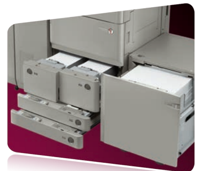
7,700-sheet maximum paper capacity